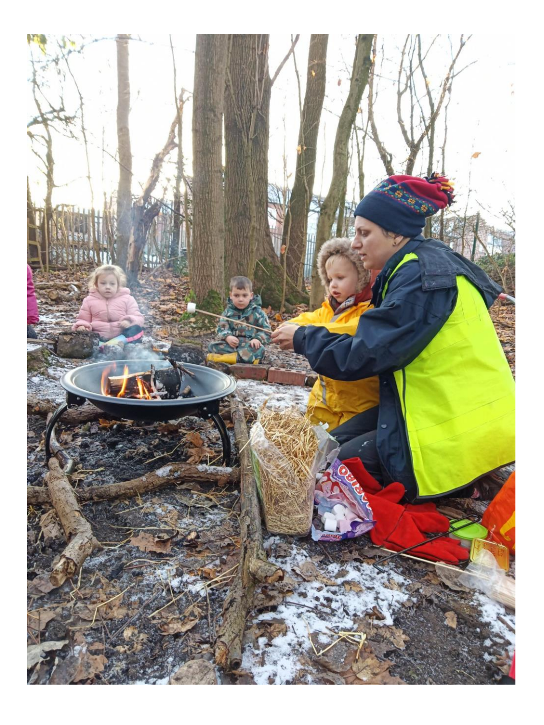
'Never settle for less than your best'

St. George's Central seeks to provide quality education rooted in the Christian faith, serving the spiritual, moral, and educational needs of the community of which it is part.